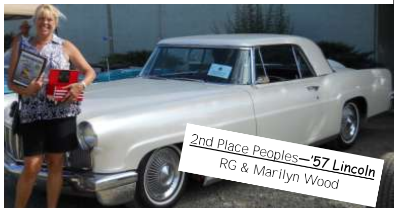
2nd Place Peoples—'57 Lincoln RG & Marilyn Wood