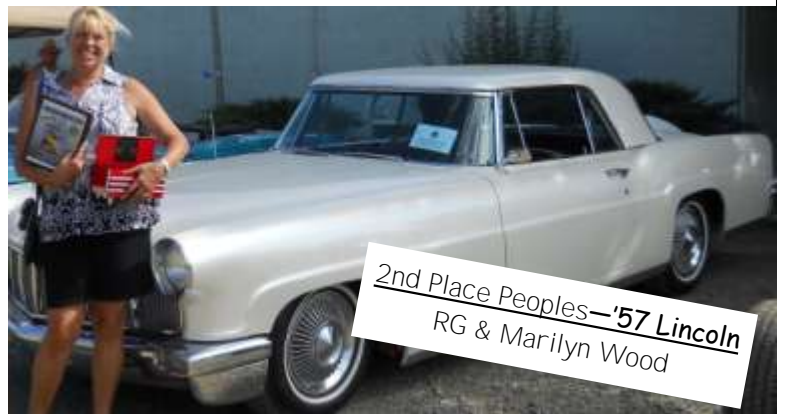
2nd Place Peoples—'57 Lincoln RG & Marilyn Wood