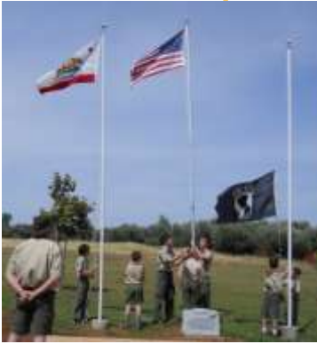
Boy Scout Troop #59 performed the opening ceremonies with the raising of the flags and the Pledge of Allegiance. No Boundary's sang the National Anthem.